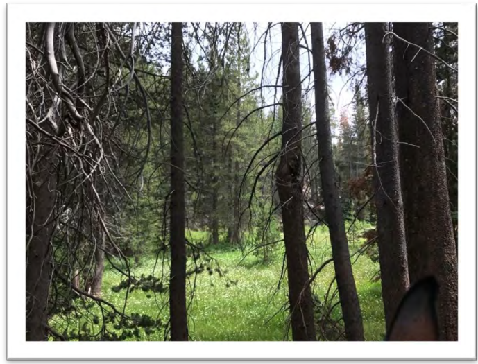
A Meadow on the Clicks Creek Trail