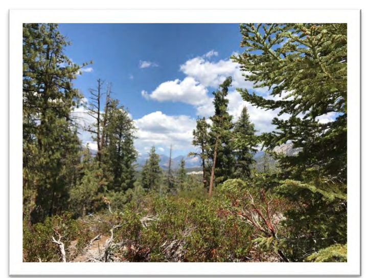
Golden Trout Wilderness