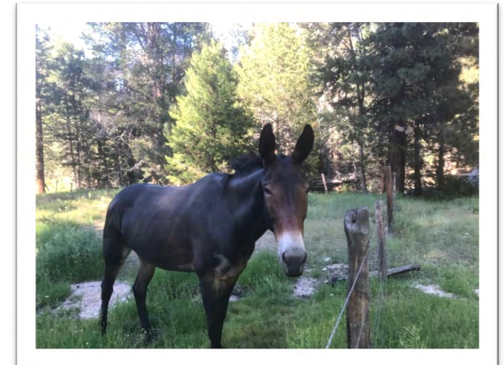
"Mary" enjoying Grey Meadow