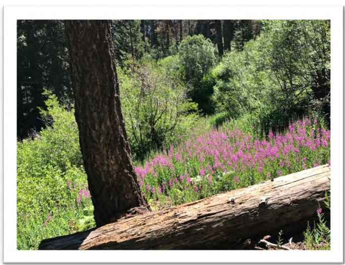
Golden Trout Wilderness